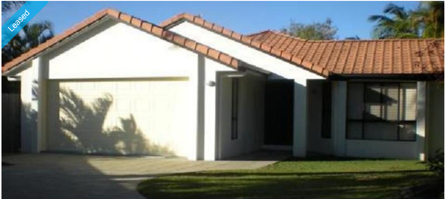
5 Lowe Court, Tewantin