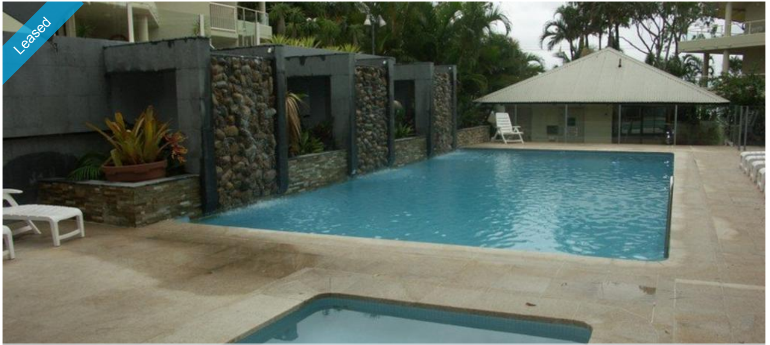
Unit 22, 291 Gympie Terrace, Noosaville