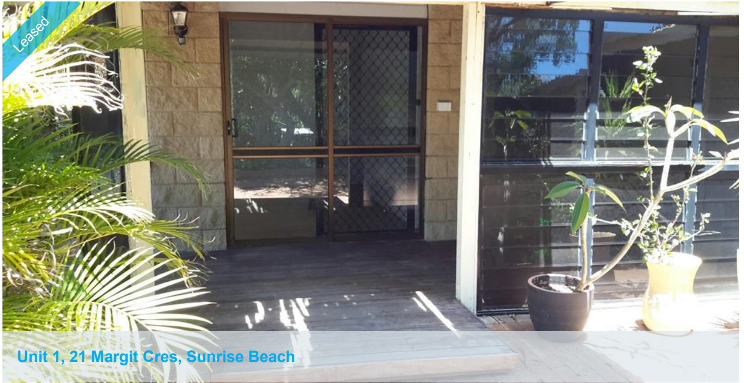
Unit 1, 21 Margit Cres, Sunrise Beach