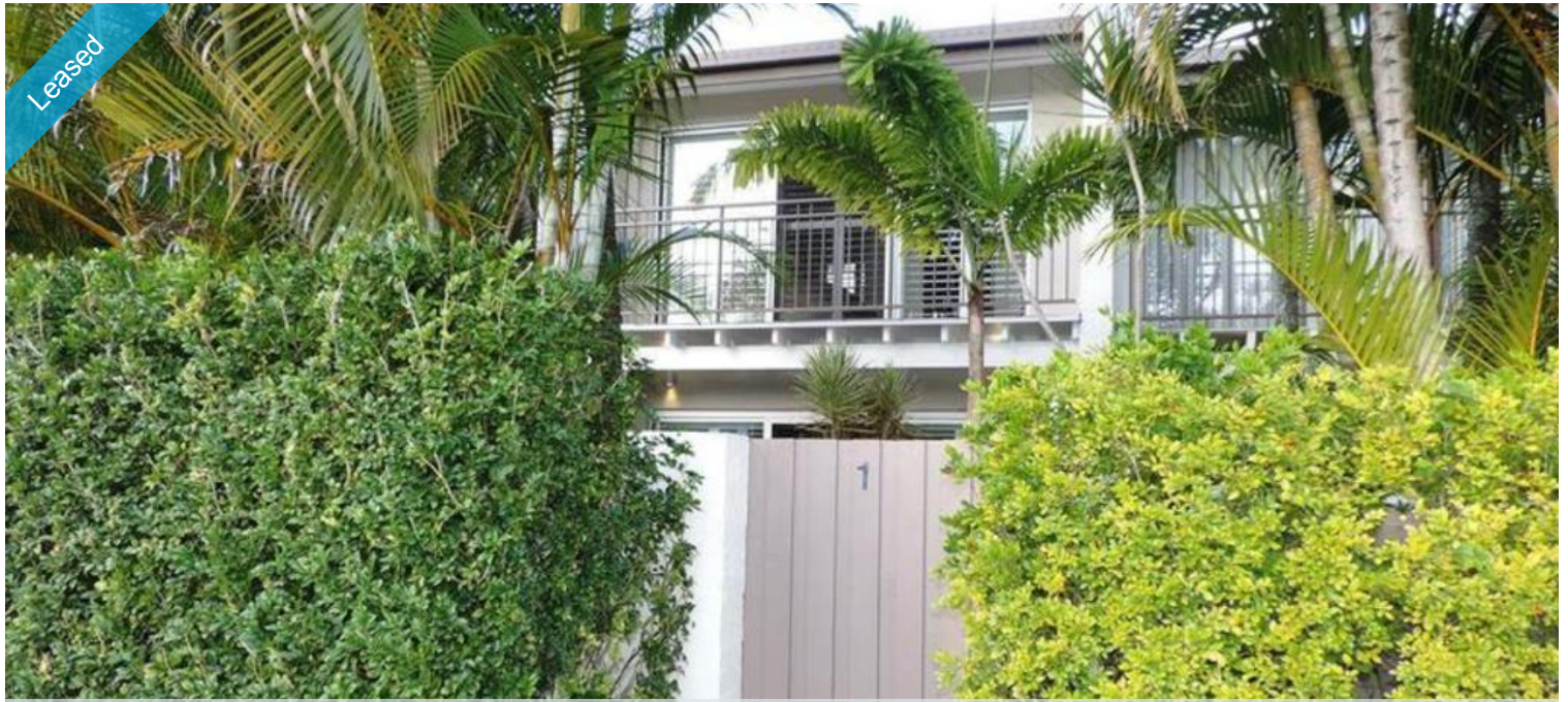
Unit 1, 83-85 Noosa Pde, Noosa Heads